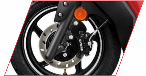
Front Disc Brake