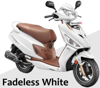
Pearl Fadeless White