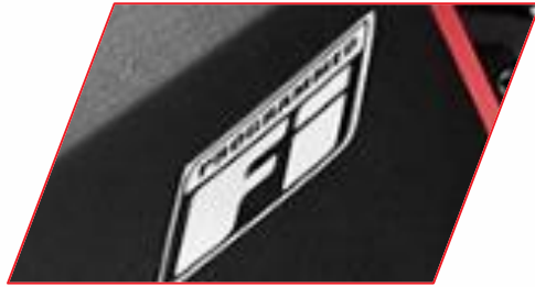
India's first scooter with Programmed Fi Engine