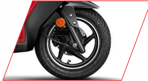
Diamond Cut Alloy Wheels